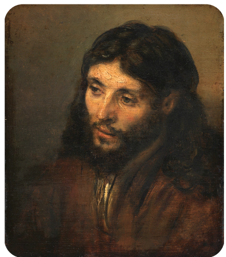
Head of Christ , Rembrandt, 1645-1650